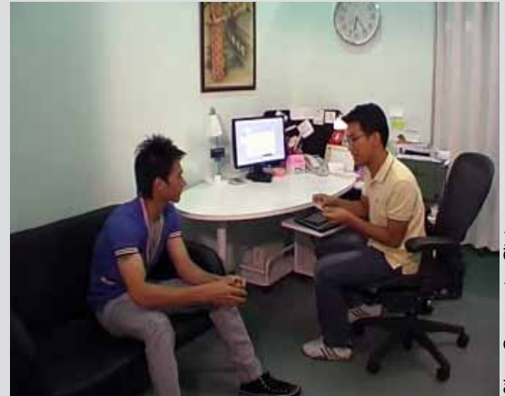
Silom Community Clinic